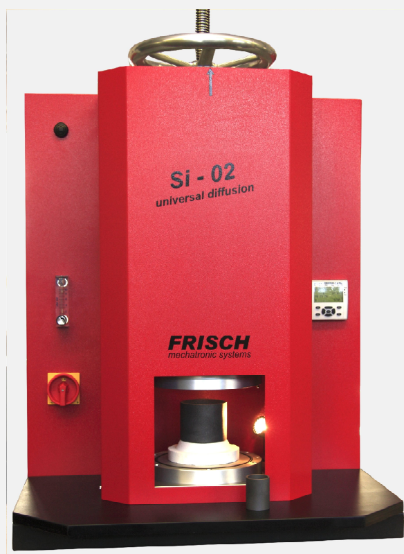
tabletop type Si-02 universal diffusion

Seamless and brazing solder free multicolour wedding rings and other jewellery of platinum, gold, silver and stainless steel rings - sheets - powder - grains - Mokume Gane